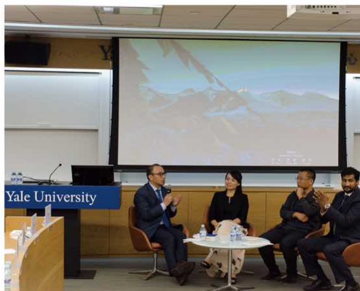
Screening of Himalaya: Ladder to Paradise co-sponsored by the Yale Himalayan Initiative