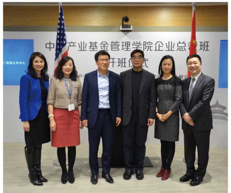
CITIC Private Equity Portfolio Executives Leadership Program