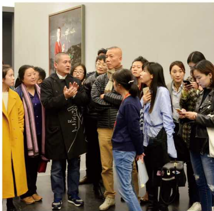
YCB-Christie's Program participants discuss contemporary art with artists Zeng Fanzhi and Cai Guoqiang at the Ullens Center for Contemporary Art