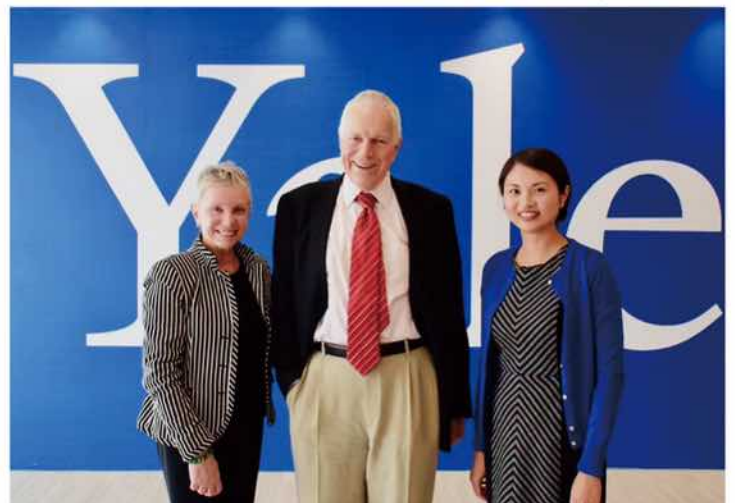
Nobel Prize winner Edmund Phelps (PhD '59) discussed China's role in today's world