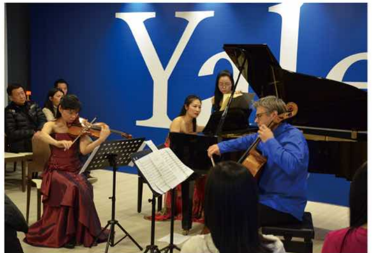
2017 Yale New Year Concert

Hugo award-winning author Hao Jingfang on “Folding Beijing and the Future of Science Fiction”