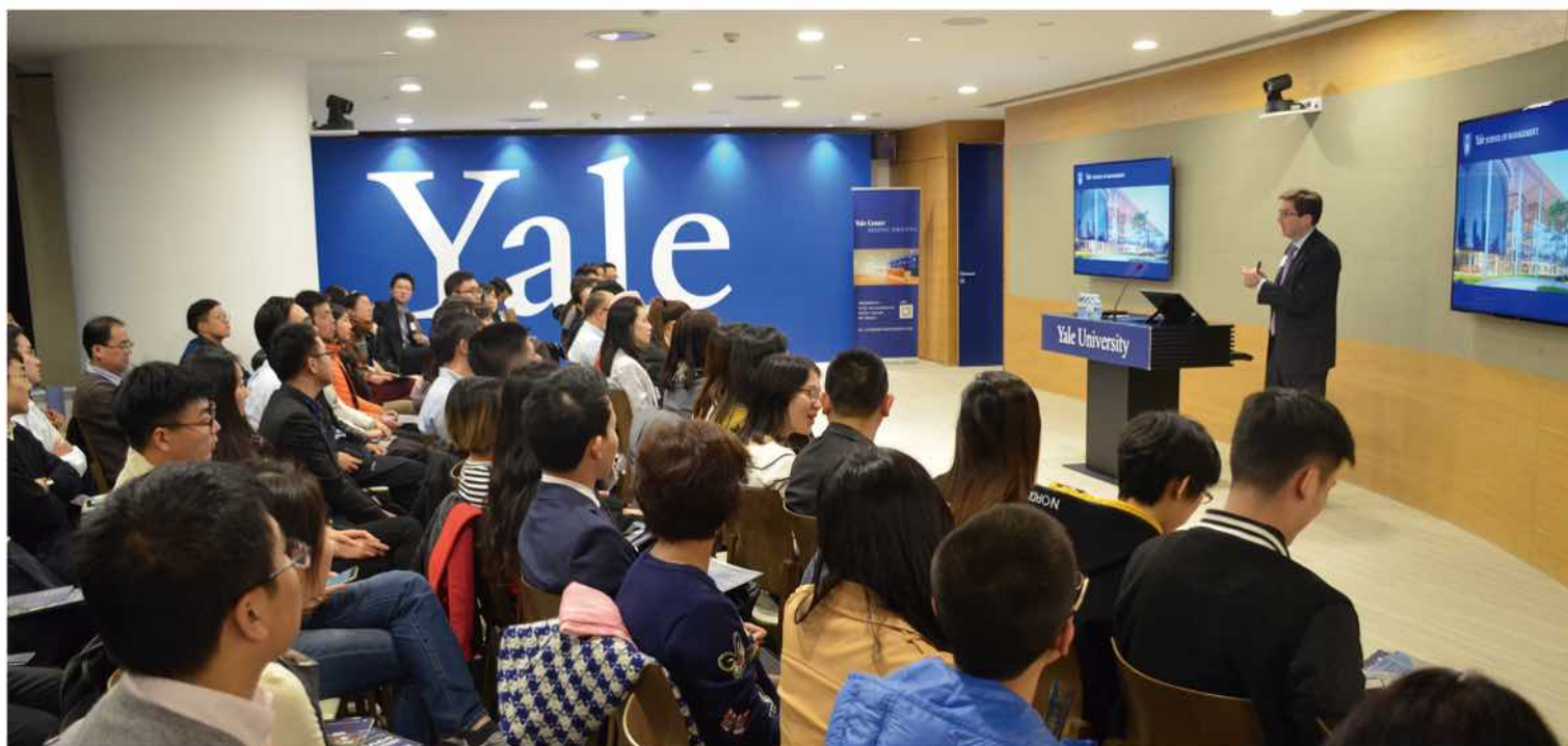
Yale SOM Admissions Reception