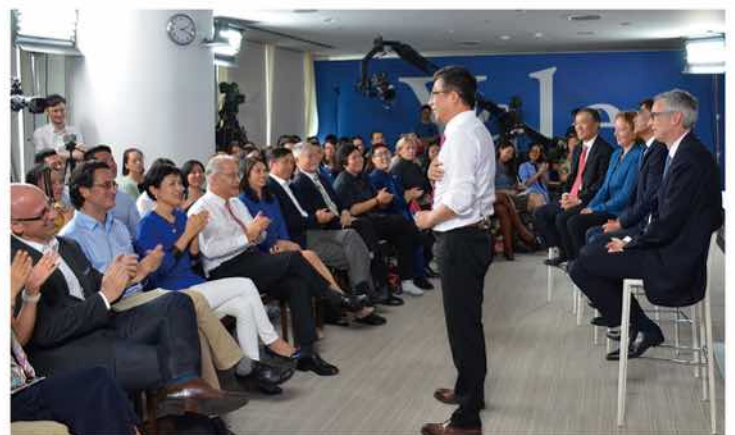
YCB and CGTN host the "One Belt, One Road" Program Series