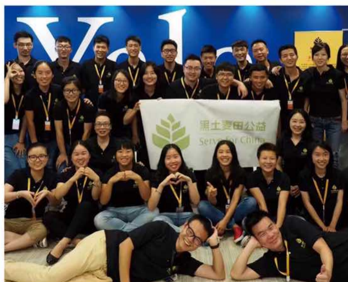
Serve for China, a Yale-alumni initiative that aims to spur rural development, innovation, and entrepreneurship