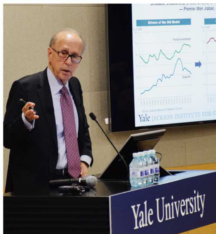
Professor Stephen Roach on “The World Without China”

“ I continue to find Yale Center Beijing a most effective platform for delivering my macro message on China and the world economy to a broad cross-section of the Beijing community. The staff of the Center is quite accomplished in maximizing onsite and online attendance — as well as in leveraging the message with the Chinese media. And we have been able to use our meetings to draw a large pool of potential applicants to the master’s program of the Yale Jackson Institute for Global Affairs. The Center is an invaluable resource for Yale’s China focus.