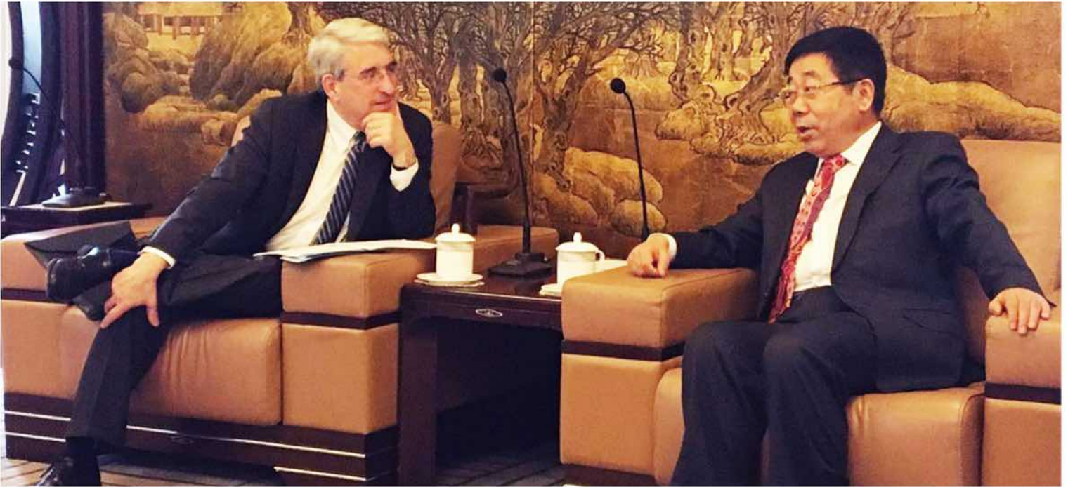
President Peter Salovey met with China's Minister of Education Chen Baosheng