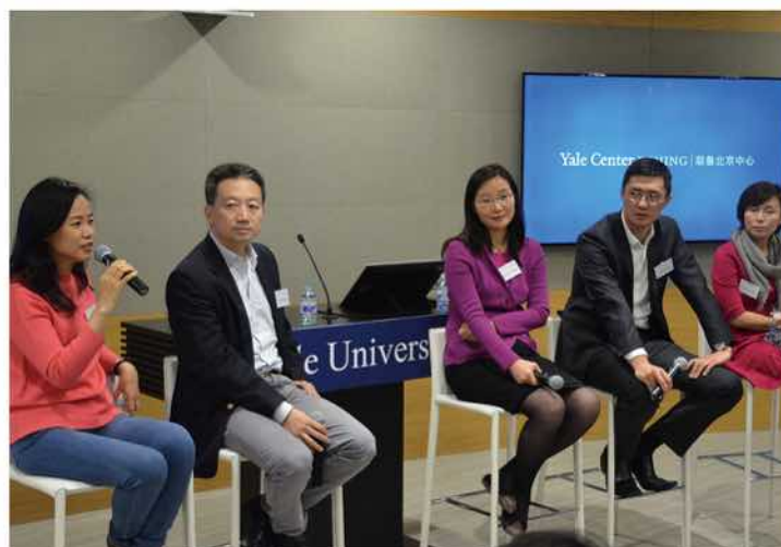
Yale Alumni on the future of venture capital and private equity