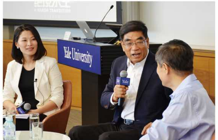
A Harsh Transition Documentary Screening, which received coverage by the Financial Times and Fortune , to name a few