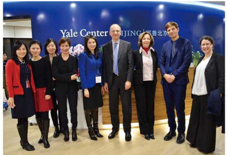
Former Italian Prime Minister Enrico Letta led a discussion on the future of globalization