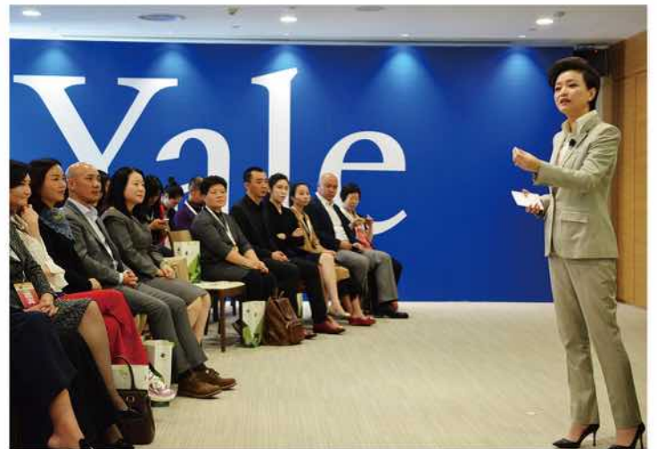
Yang Lan, a leading broadcast journalist and media entrepreneur, on female leadership