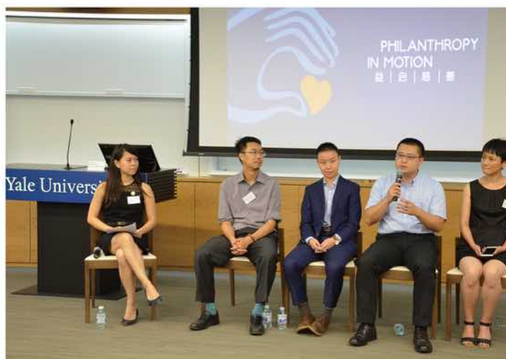
Philanthropy in Motion's Model Foundation Program, a Yale-alumni initiative that aims to groom the next generation of social entrepreneurs