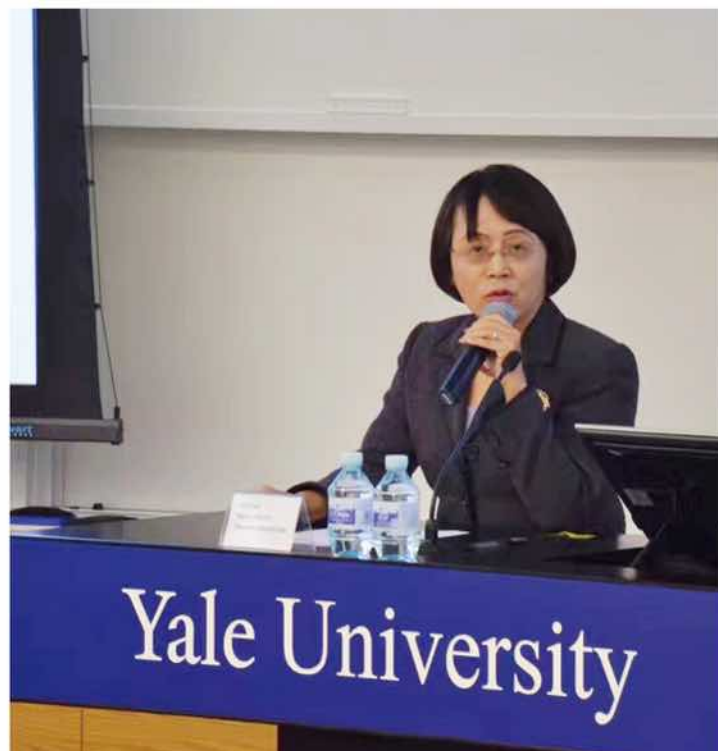
Hu Shuli, editor-in-chief of Caixin Media, on China-U.S. outbound investments