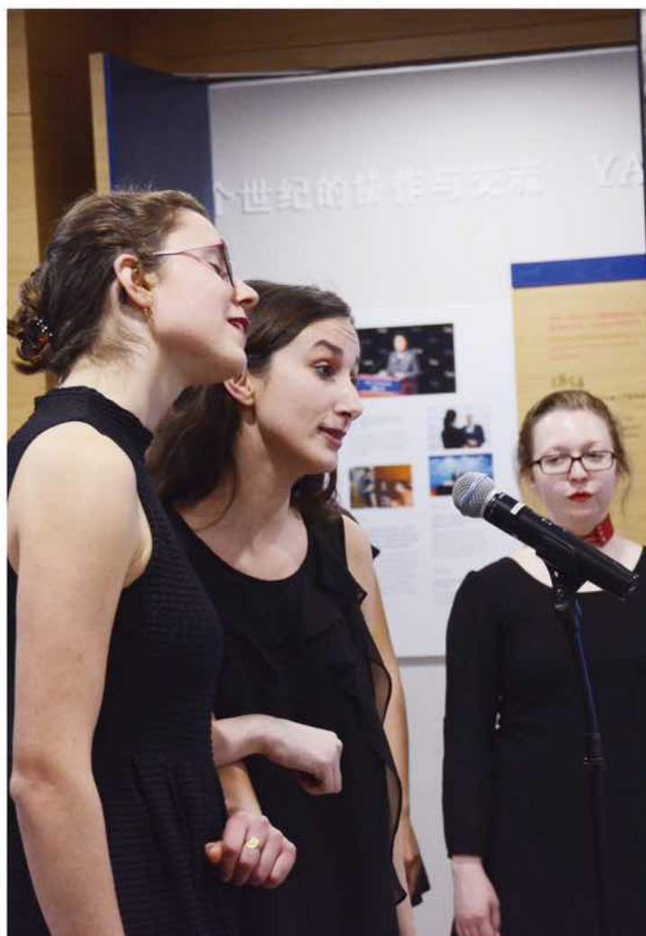
“Proof of the Pudding” A Cappella Group Concert