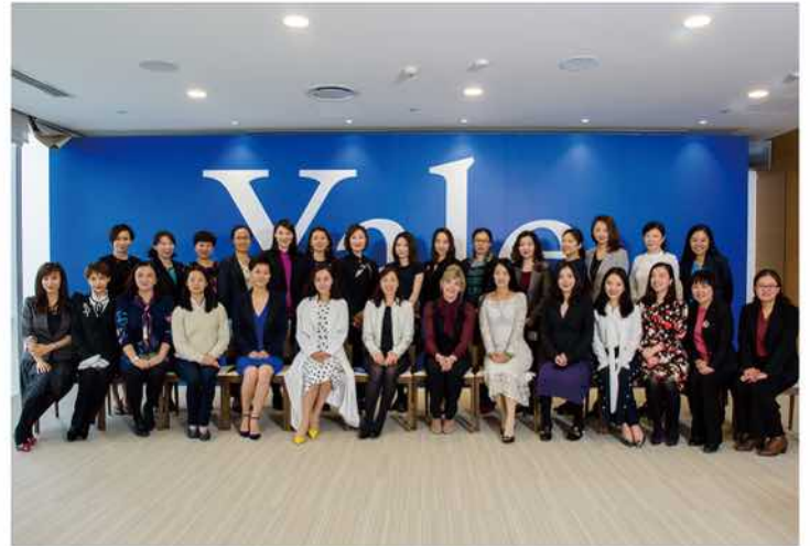
Women's Leadership Program