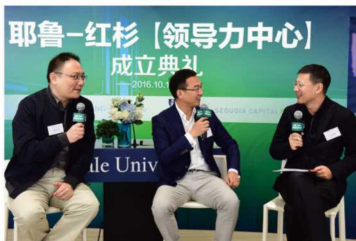
Neil Shen, YCB Executive Council Chairman and other luminaries at the opening ceremony of the Yale SOM-Sequoia China Leadership Program

ZhenFund-sponsored AI Entrepreneurship Camp